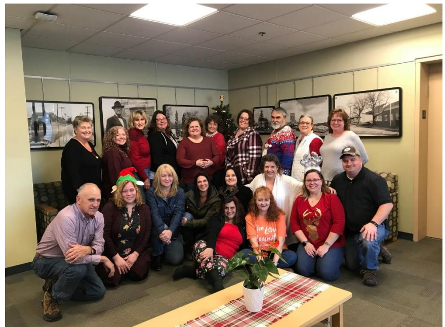
Some of our Find Toby Volunteers and a few spouses came together for a holiday party in December. Our Thanks to the Camp Hill Giant Community Room.