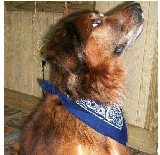
Our site's founding pup and namesake - Toby Kraut